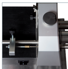
Set the cutting length.