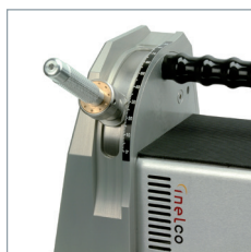
Grind the electrode in the desired angle.